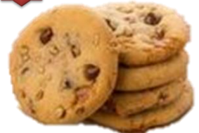
Caramel Pecan Chocolate Chip